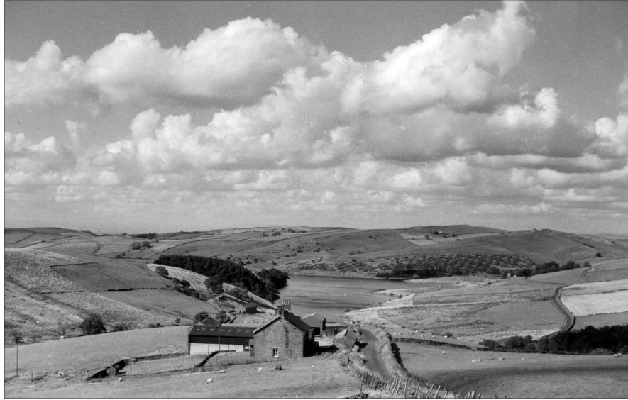
The classic view of Lamaload

Carry on in the same direction, uphill, and cross the next stile in the wall facing you. Continue uphill, with the wall on your immediate right. Just before the remains of a wall jutting out to the left, cross the stile on your right. Turn left and again head uphill, with the wall initially on your immediate left and Newbuildings Farm further to your left. As the wall turns away leftwards, carry on in the same direction that you were heading and cross a stone step-stile by a gate (7).