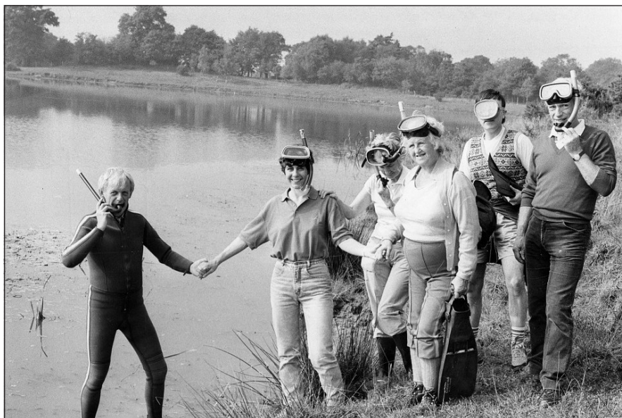
The author leading intrepid walkers along a wetter-than-usual path

which will take you back to the Plough and Flail if you wish to shorten the walk. Otherwise, carry on past a bridleway on your right that would take you to the Quaker graveyard (a very worthwhile diversion) and past a group of houses.